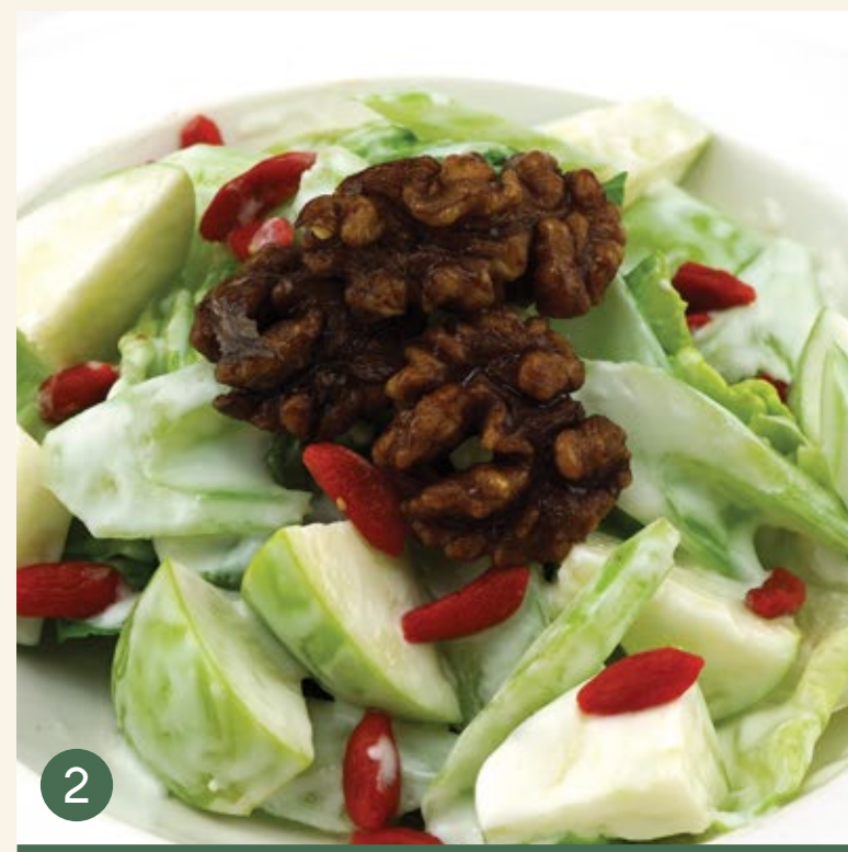
2 Green Apple, Celery, Walnut with Fruit Yoghurt