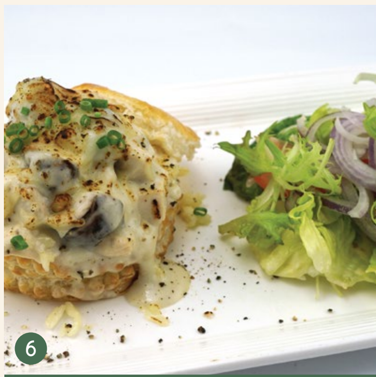
6 Chicken Mushroom vol-au-vent