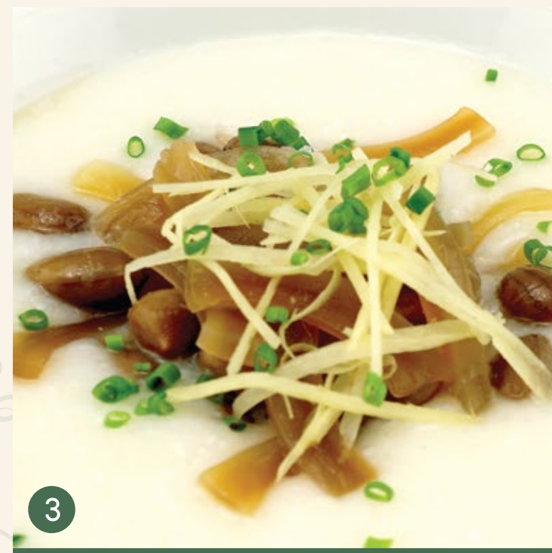
3 Braised Peanut with Cuttle Fish Porridge