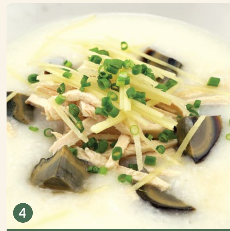
4 Century Egg with Chicken Porridge