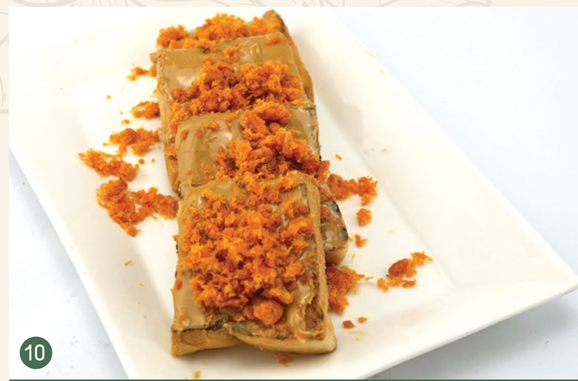
10 Thick Toast Set Coffee or Tea (peanut butter, chicken floss & 2 soft boiled eggs)