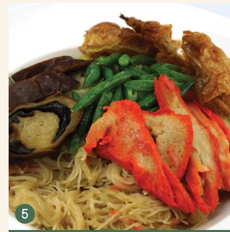
5 Vegetarian Bee Hoon with Mock Char Siew