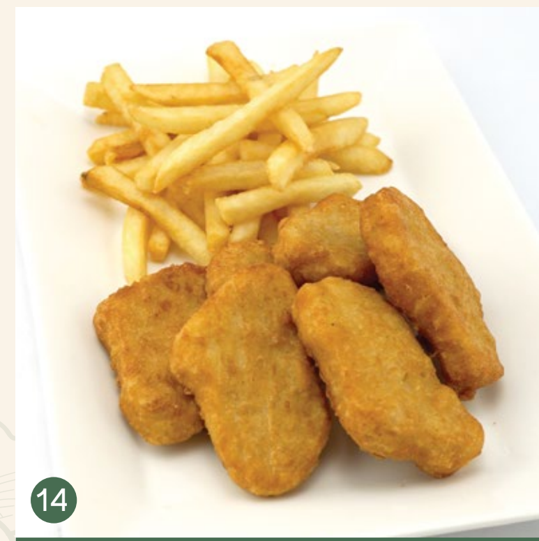
14 Chicken Nuggets