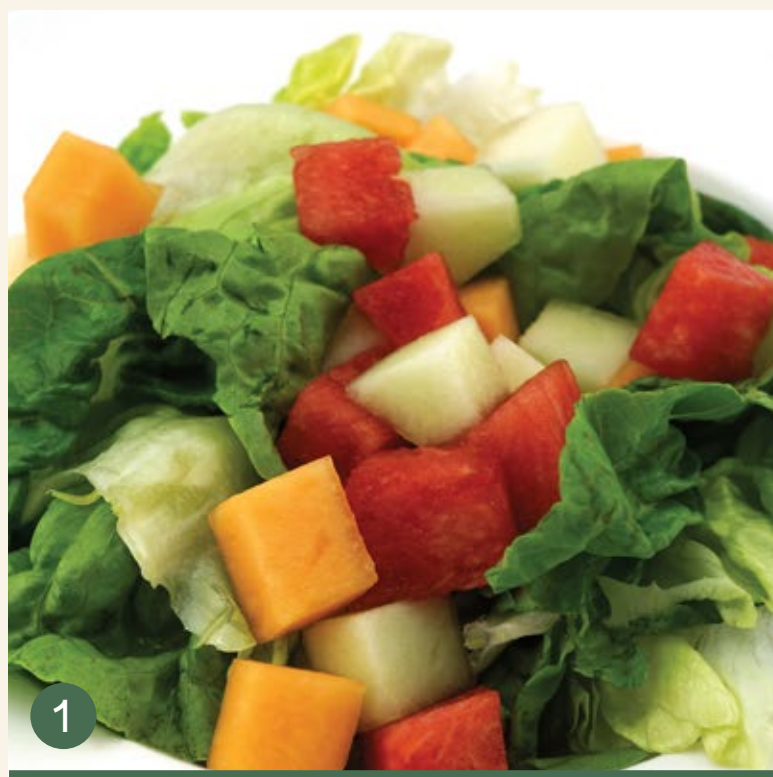
1 Fresh Tropical Fruit Salad with Honey Pommery Mustard Dressing