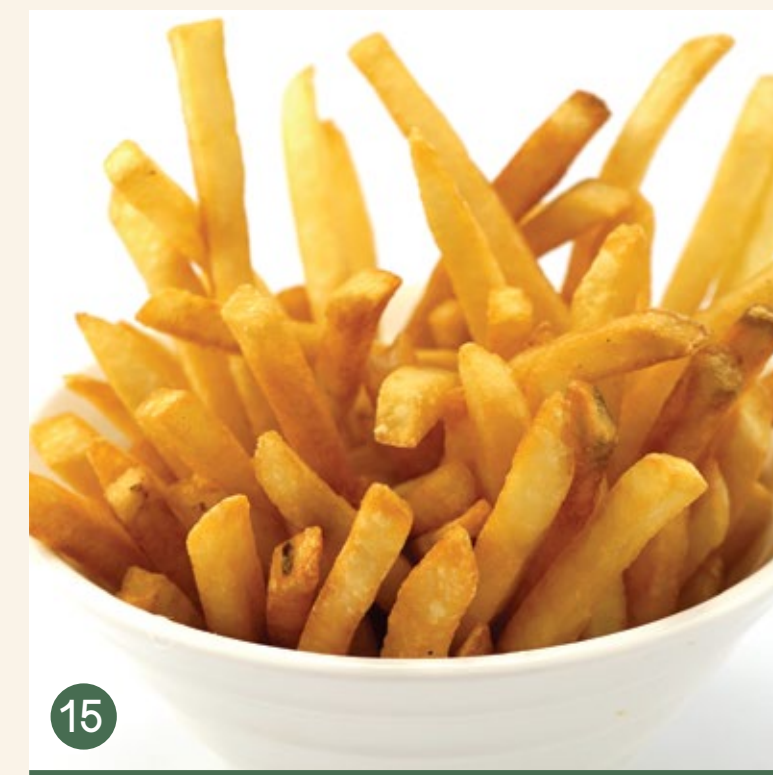
15 French Fries