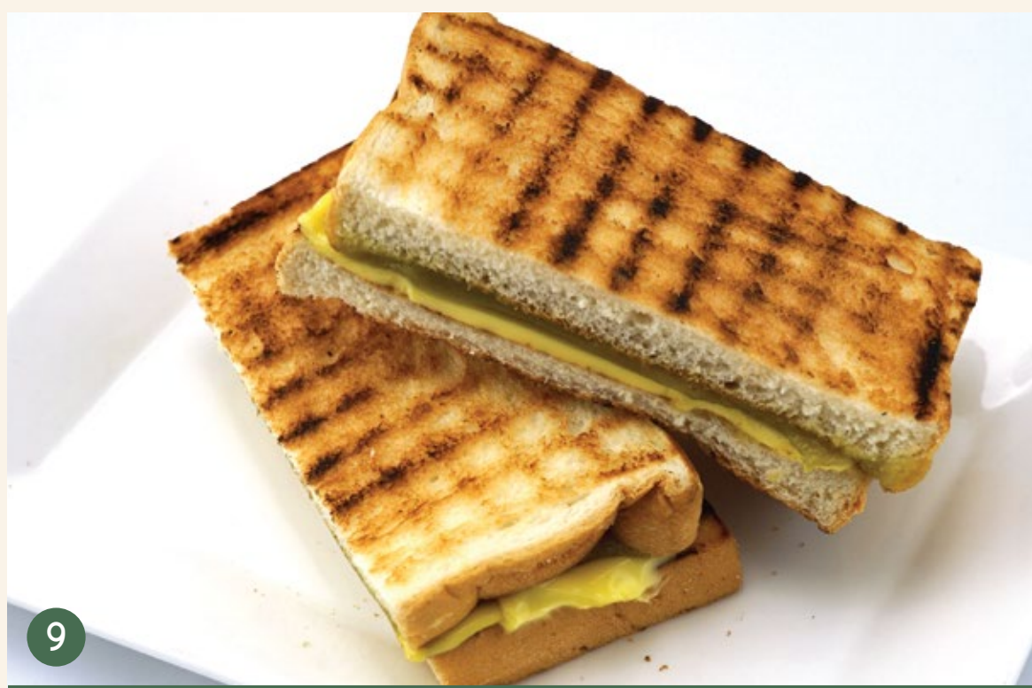
9 Toast Set with Coffee or Tea (traditional toast bread with kaya, butter & 2 soft boiled eggs)