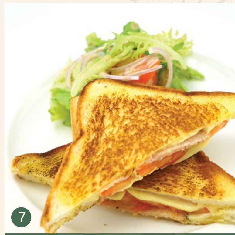
7 Pan-fried Chicken Ham, Cheese Tomato Sandwich with Mixed Salad