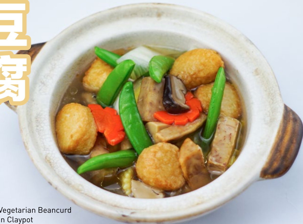
45 Vegetarian Beancurd in Claypot 砂煲豆腐 (素)