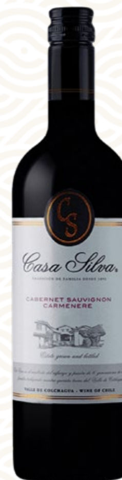
74 Casa Silva Cabernet Sauvignon