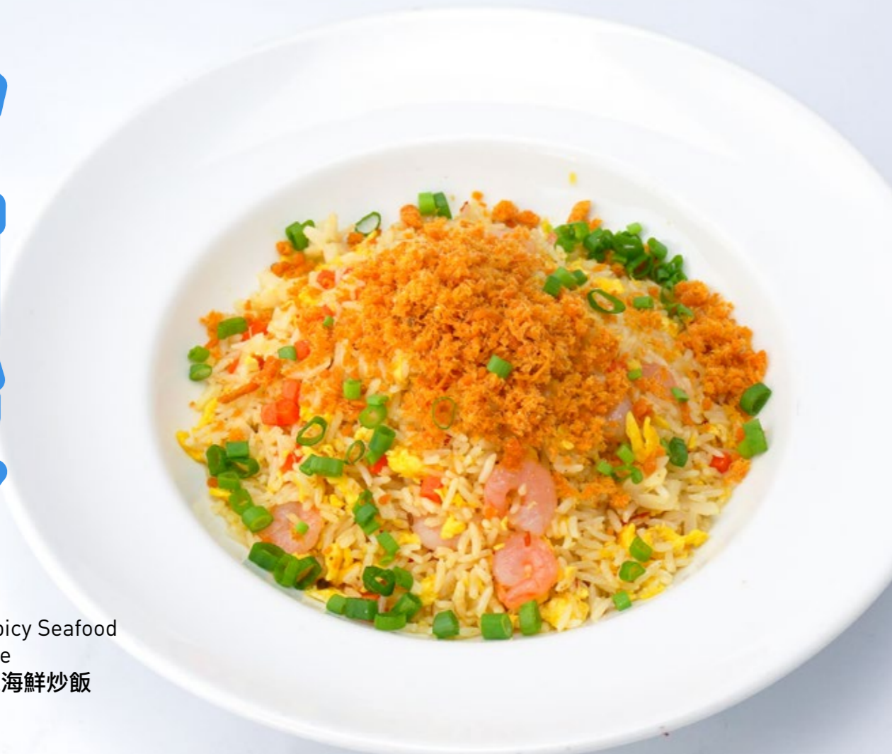
48 Nonya Spicy Seafood Fried Rice 娘惹香辣海鮮炒飯