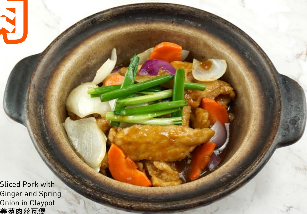
28 Sliced Pork with Ginger and Spring Onion in Claypot 姜葱肉丝瓦煲