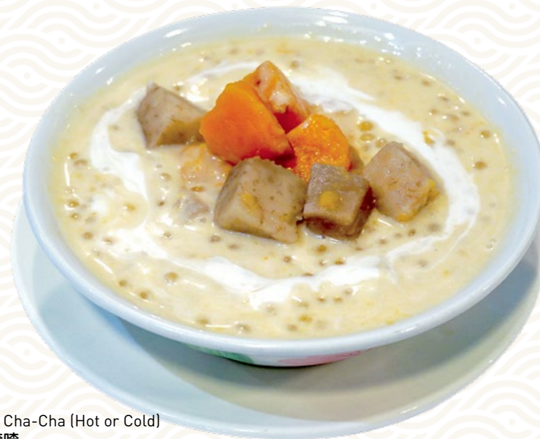
56 Bubur Cha-Cha (Hot or Cold) 摩摩喳喳