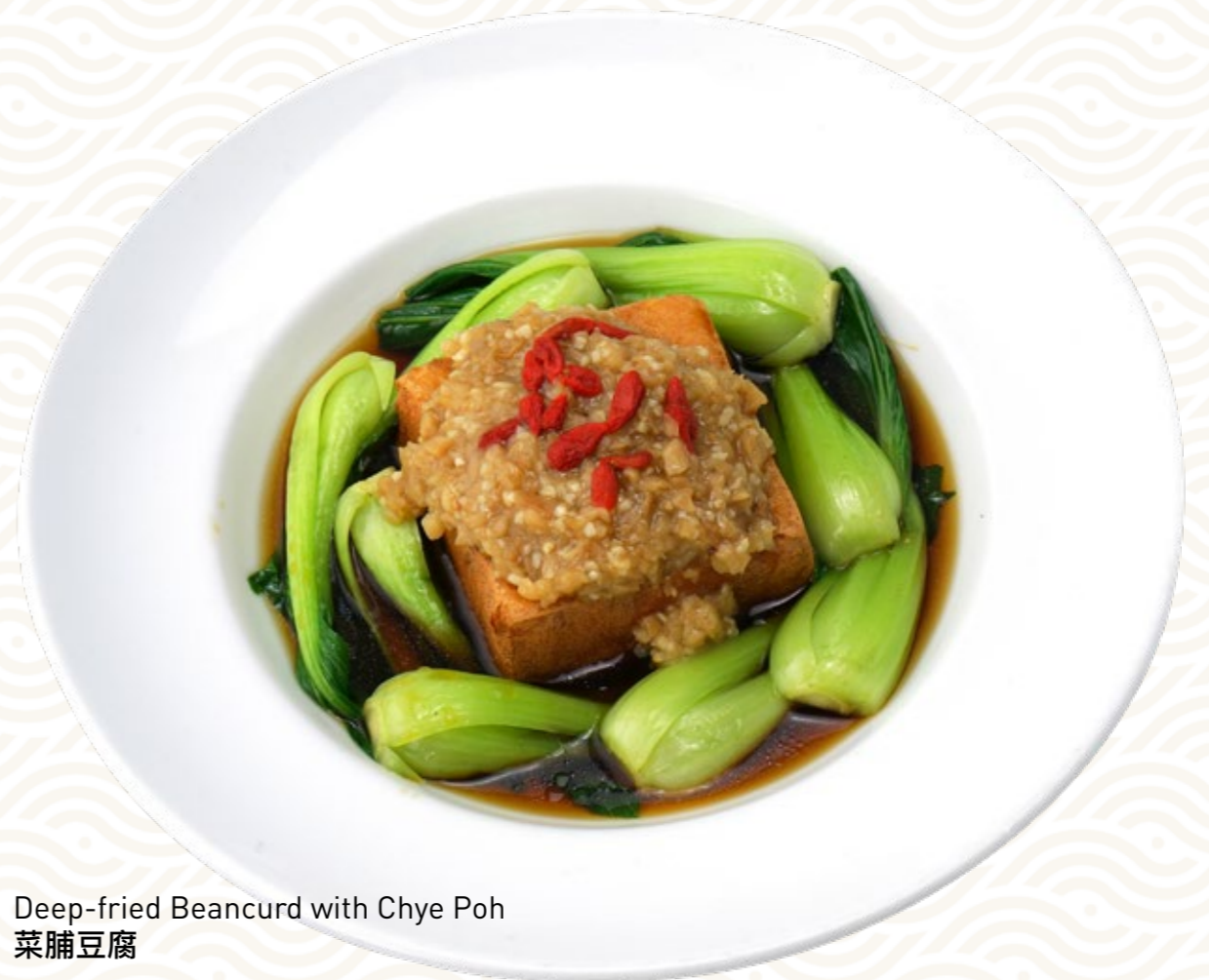
44 Deep-fried Beancurd with Chye Poh 菜脯豆腐