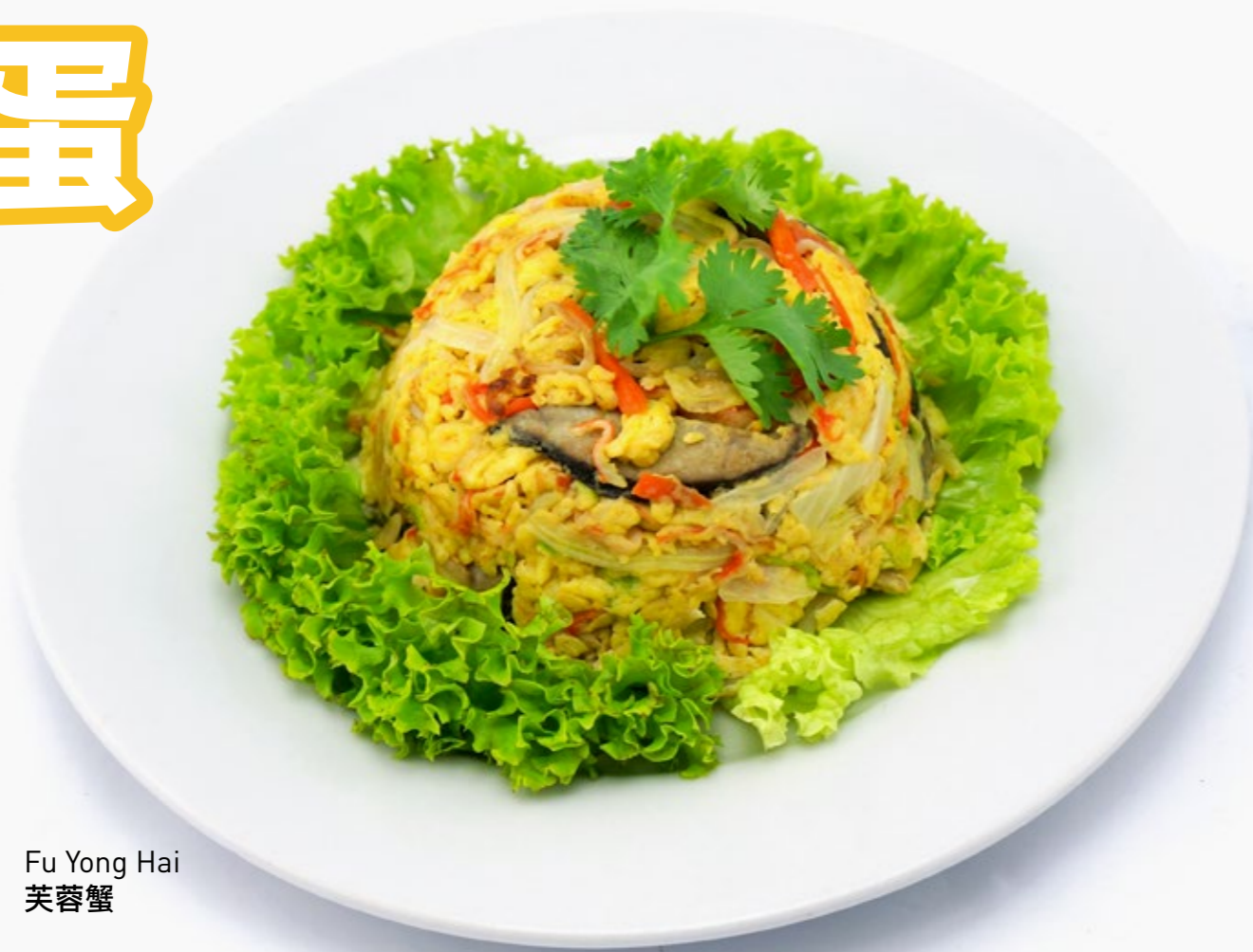
43 Fu Yong Hai 芙蓉蟹