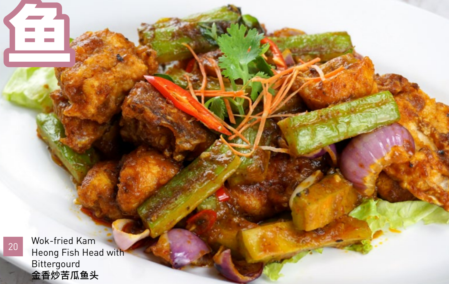
Wok-fried Kam Heong Fish Head with Bittergourd 金香炒苦瓜鱼头