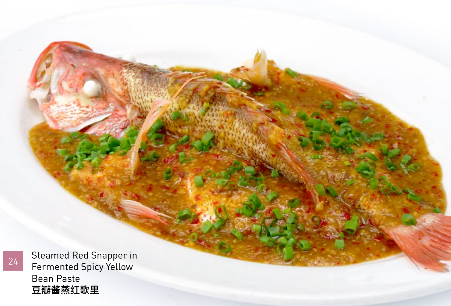
Steamed Red Snapper in Fermented Spicy Yellow Bean Paste 豆瓣酱蒸红歌里