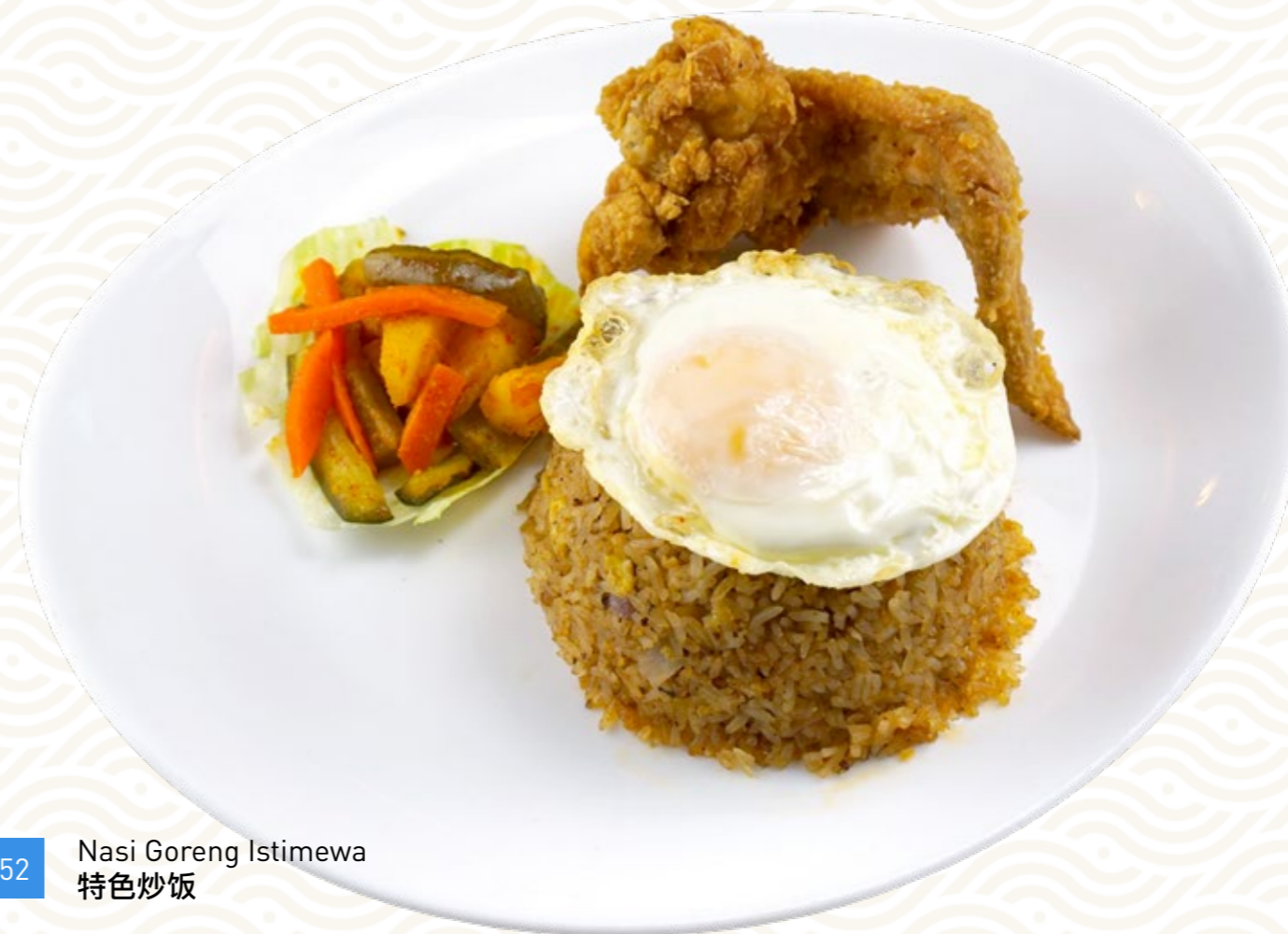
52 Nasi Goreng Istimewa 特色炒饭

★ Chef's Recommendation 🌶️ Spicy 🌿 Vegetarian