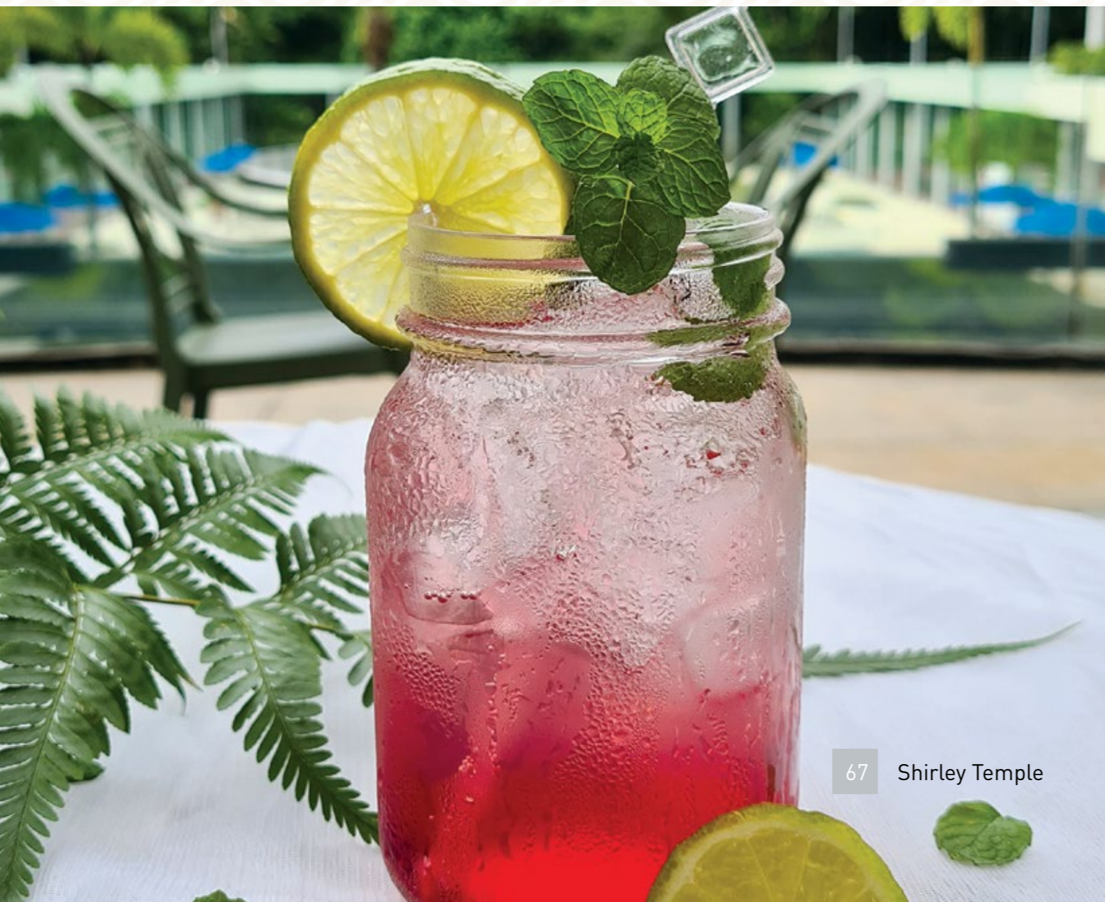
67 Shirley Temple