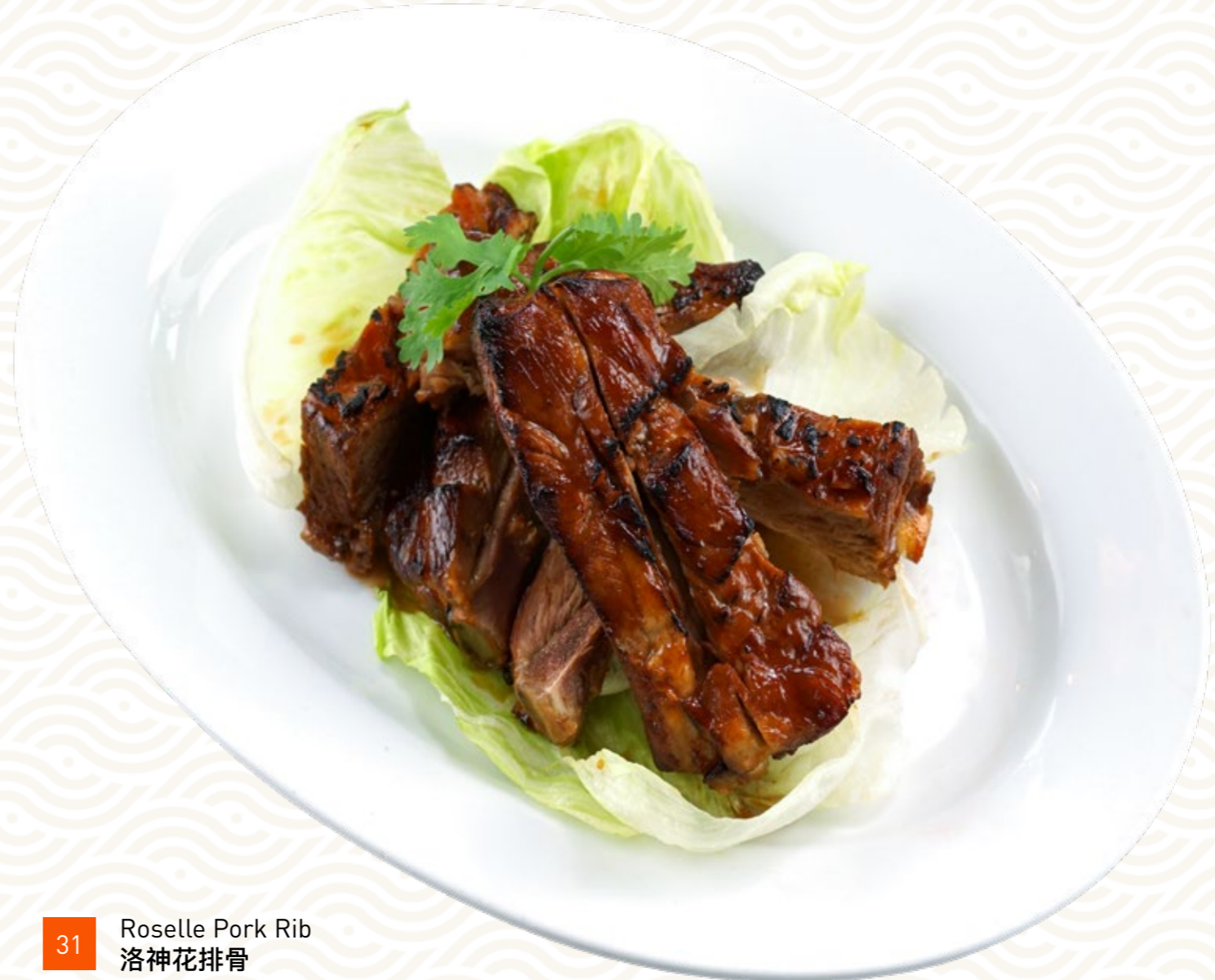
31 Roselle Pork Rib 洛神花排骨