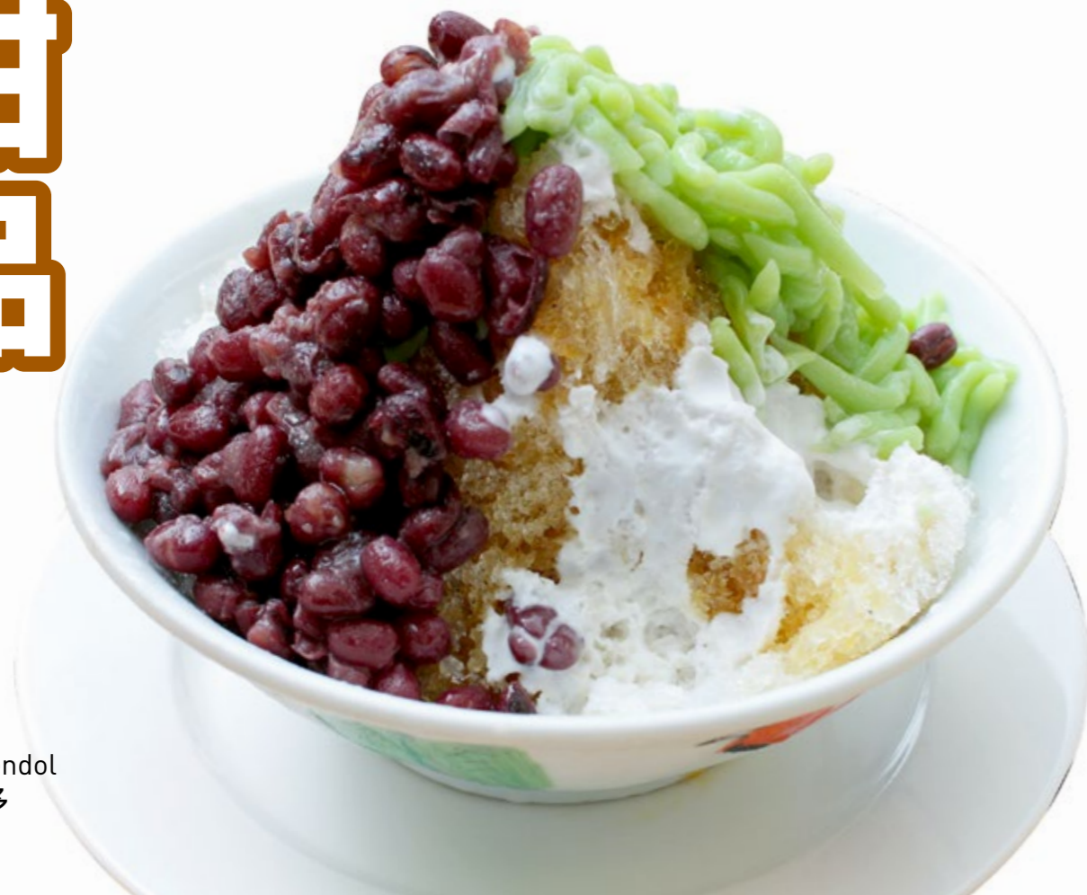
55 Chendol 煎多