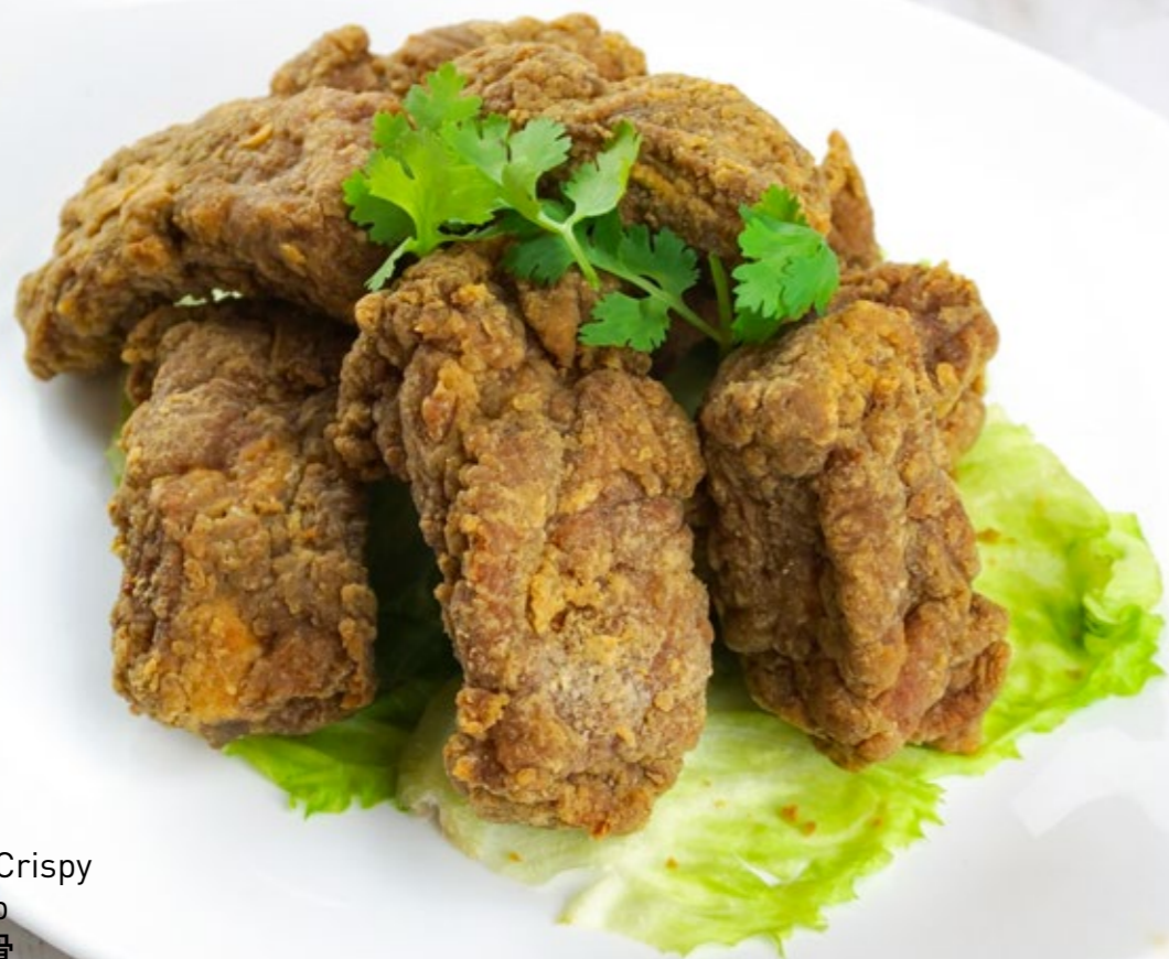
32 Golden Crispy Pork Rib 金脆排骨