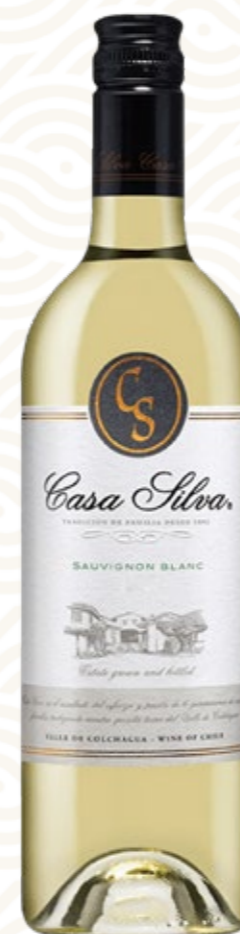
73 Casa Silva Sauvignon Blanc