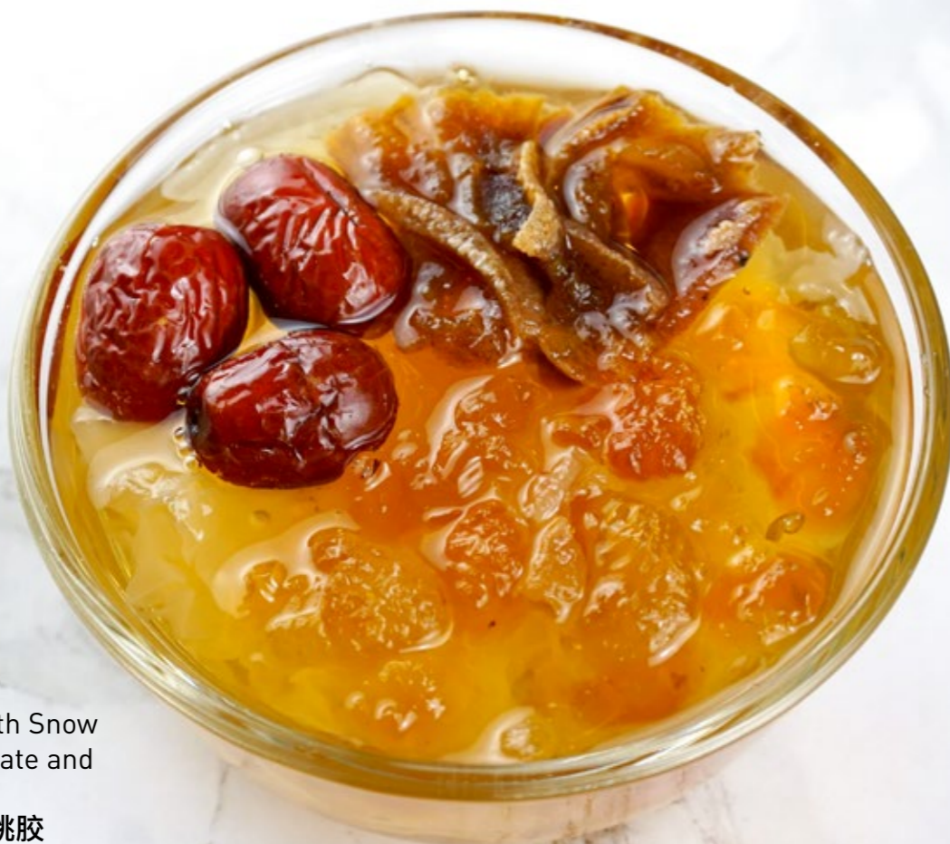
53 Peach Gum with Snow Fungus, Red Date and Persimmon 雪耳红枣柿子桃胶