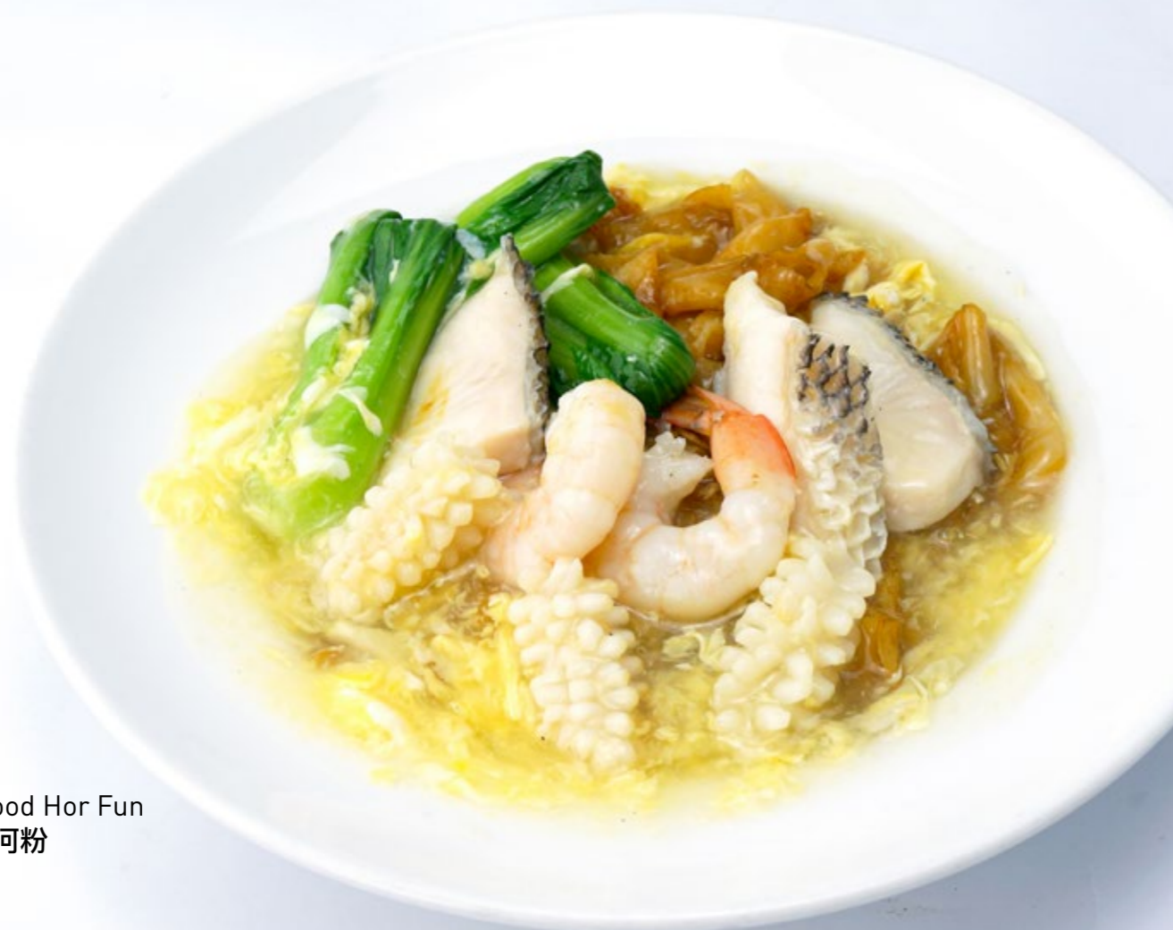
50 Seafood Hor Fun 海鮮河粉